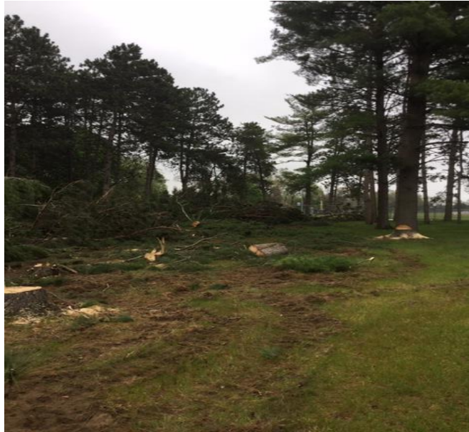
HS Tree Removal