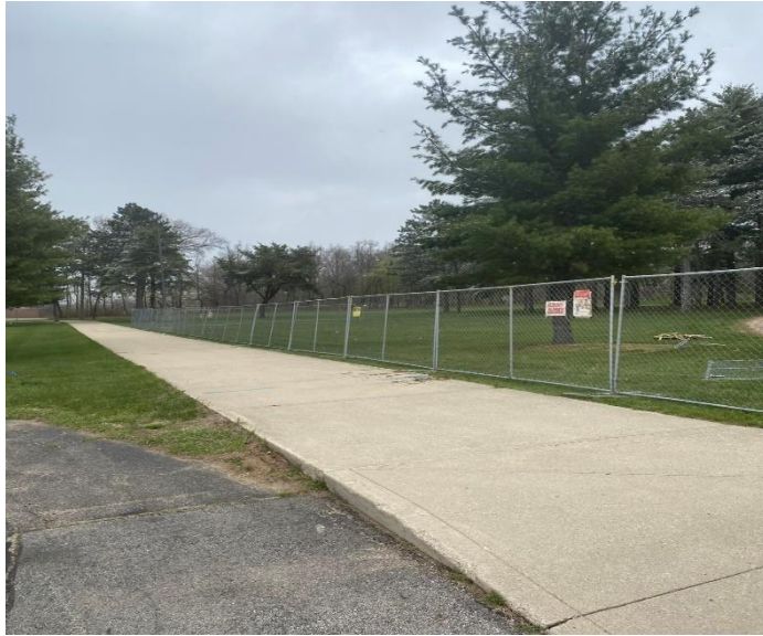
HS Temp Fencing