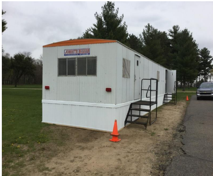
HS Jobsite Trailer