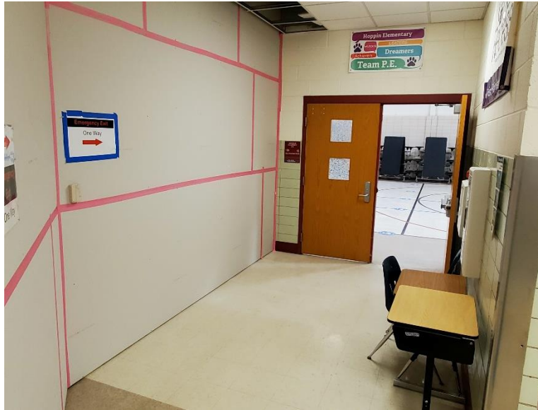
Ruth Hoppin Temp Wall