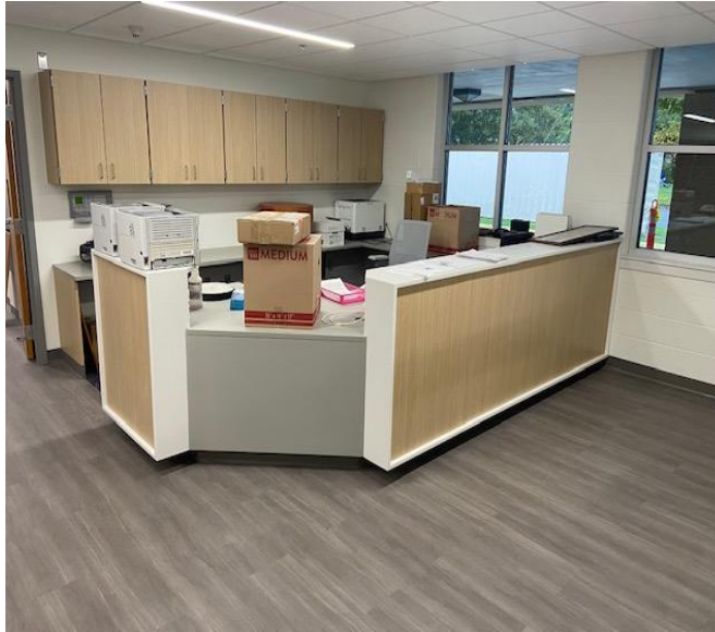
Andrews Elementary Reception Desk