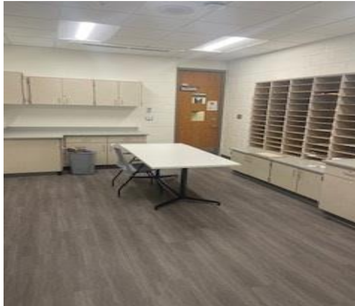
Park Reception Work Room