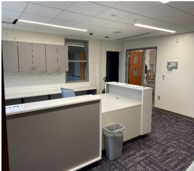
Norton Elementary Casework