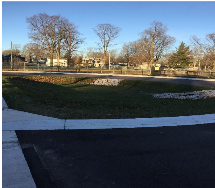
Ruth Hoppin Exterior