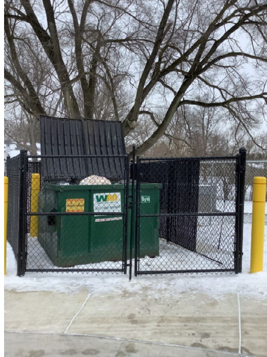
Andrews - Dumpster Enclosure