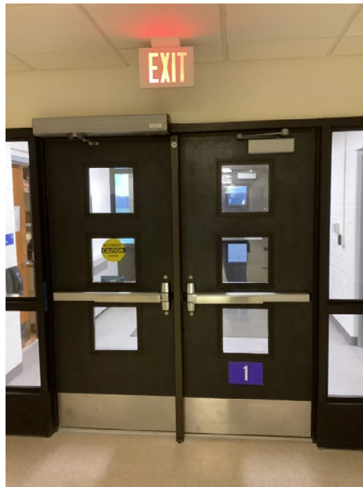
Norton – New Door Hardware