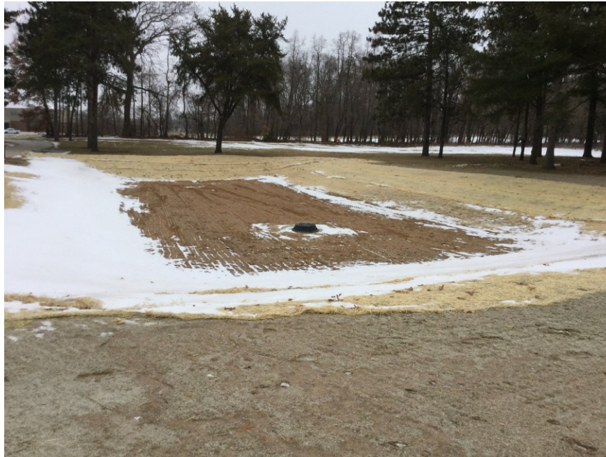
Drainage Pond Completion