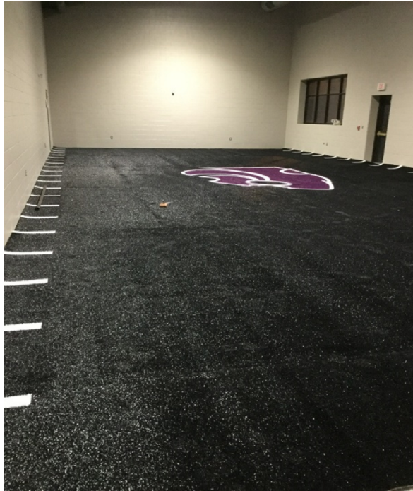
J105 Turf Room

Committee / Board Update January 17, 2022