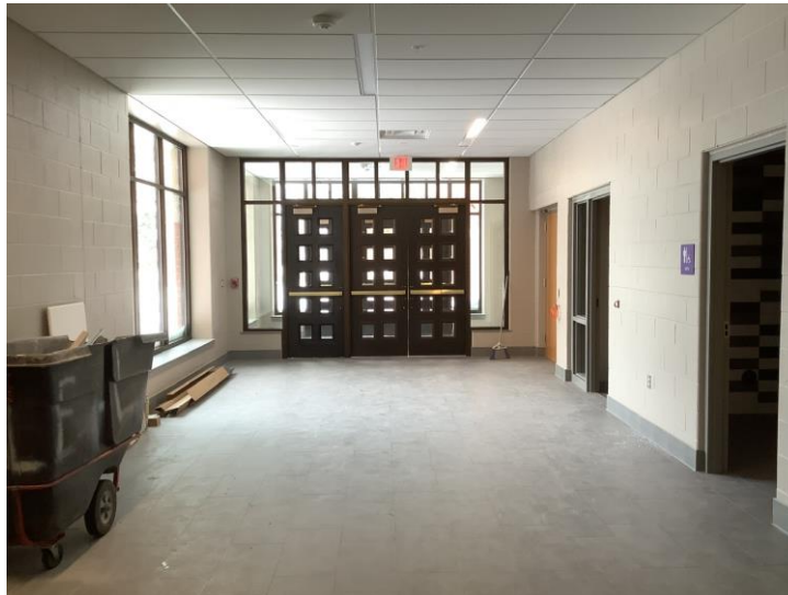
J102 –Weight Room Addition Vestibule