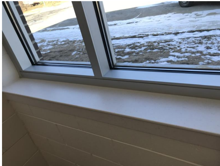
Ruth Hoppin - New Office Windows and Sills