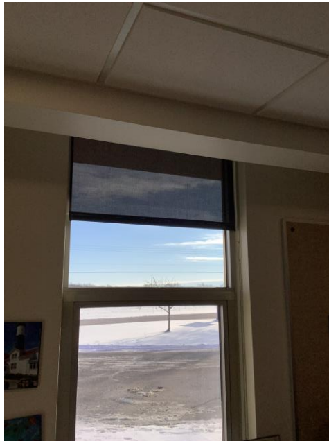
Norton – New Office Roller Shades