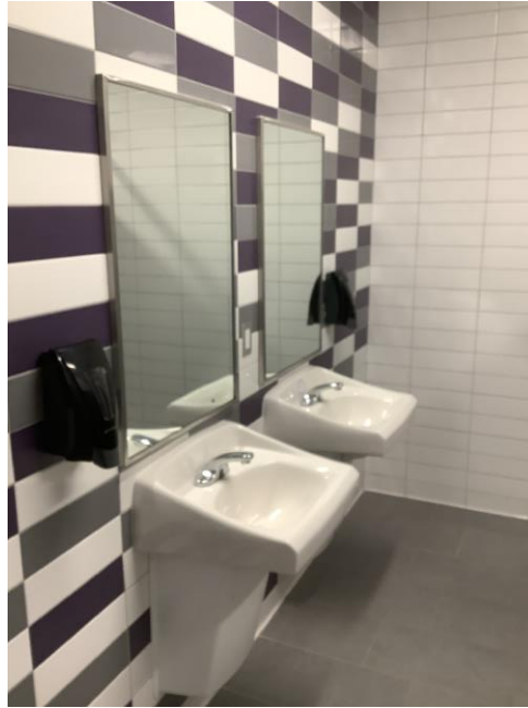
J104 –Men's Restroom

Committee / Board Update February 7, 2022