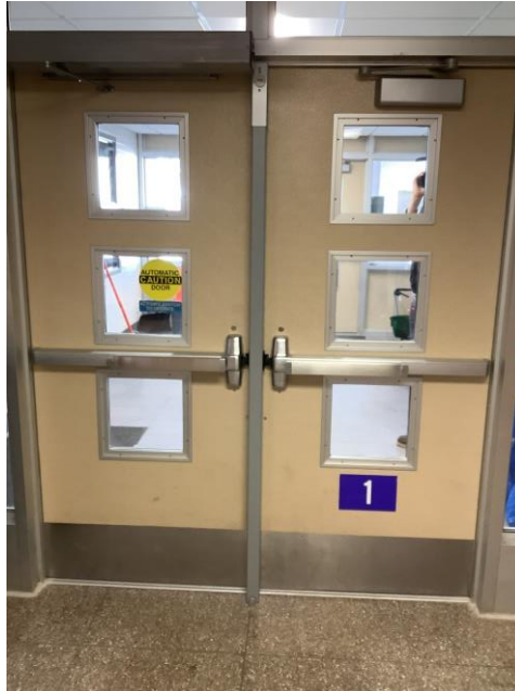
Andrews – New Door Hardware